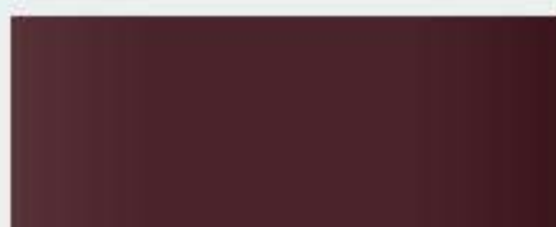
N GM: WA3307 Madera Maroon

PPG: 13349 Dupont: 4815L,4815D Acme Rogers: 5296 RM-BASF: A1899