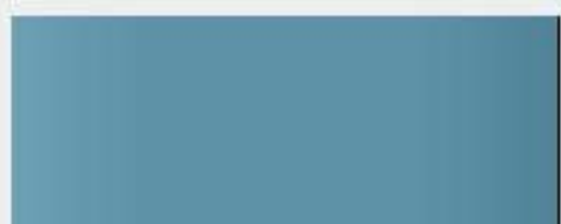
D GM: WA3560 Nantucket Blue

PPG: 50717 Dupont: 4832L,4832DH Acme Rogers: 5072 RM-BASF: A1905