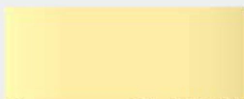
Y GM: WA3313 Butternut Yellow

PPG: 43651 Dupont: 4816L,4816D Acme Rogers: 5298 Sherwin Williams: 912 RM- BASF: A1901