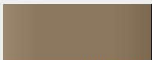
G GM: WA3667 Granada Gold

PPG: 22813 Dupont: 4826L,4826D Acme Rogers: 5304 Sherwin Williams: L11- N2620,J3-891 RM-BASF: A1908