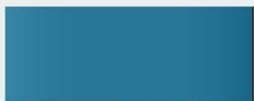
F GM: WA3680 Marina Blue

PPG: 71583 Dupont: 4822LH,4822DH Acme Rogers: 5303 Sherwin Williams: 917 RM- BASF: A1907R